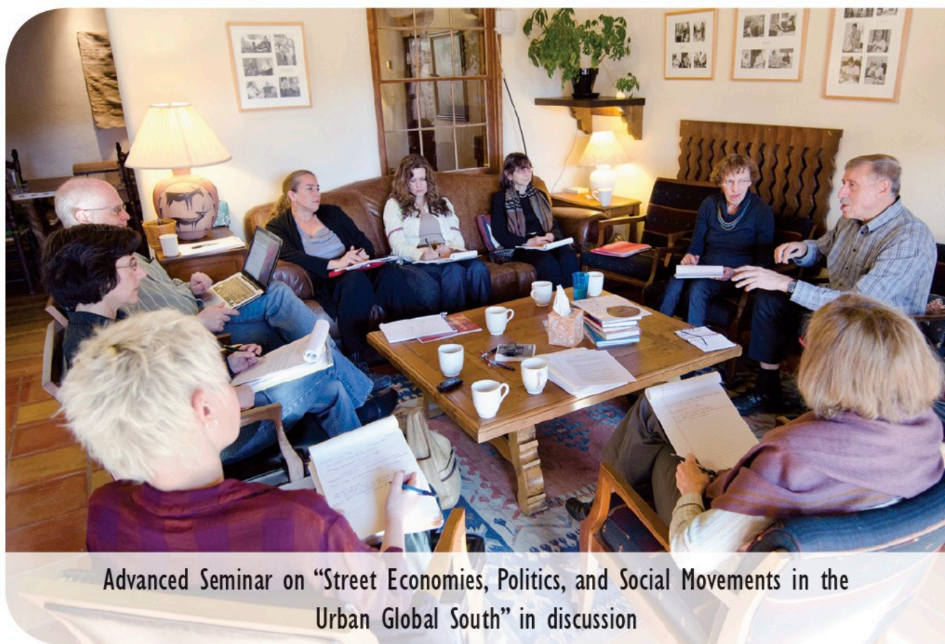
Advanced Seminar on "Street Economies, Politics, and Social Movements in the Urban Global South" in discussion

The library hosts a 9,000-volume collection with concentrations in the history of anthropology, anthropological theory, and Mesoamerican and Southwestern research, in addition to more than fifty journal subscriptions. An archival collection of papers related to the history of early twentieth-century New Mexico is also housed in the library.