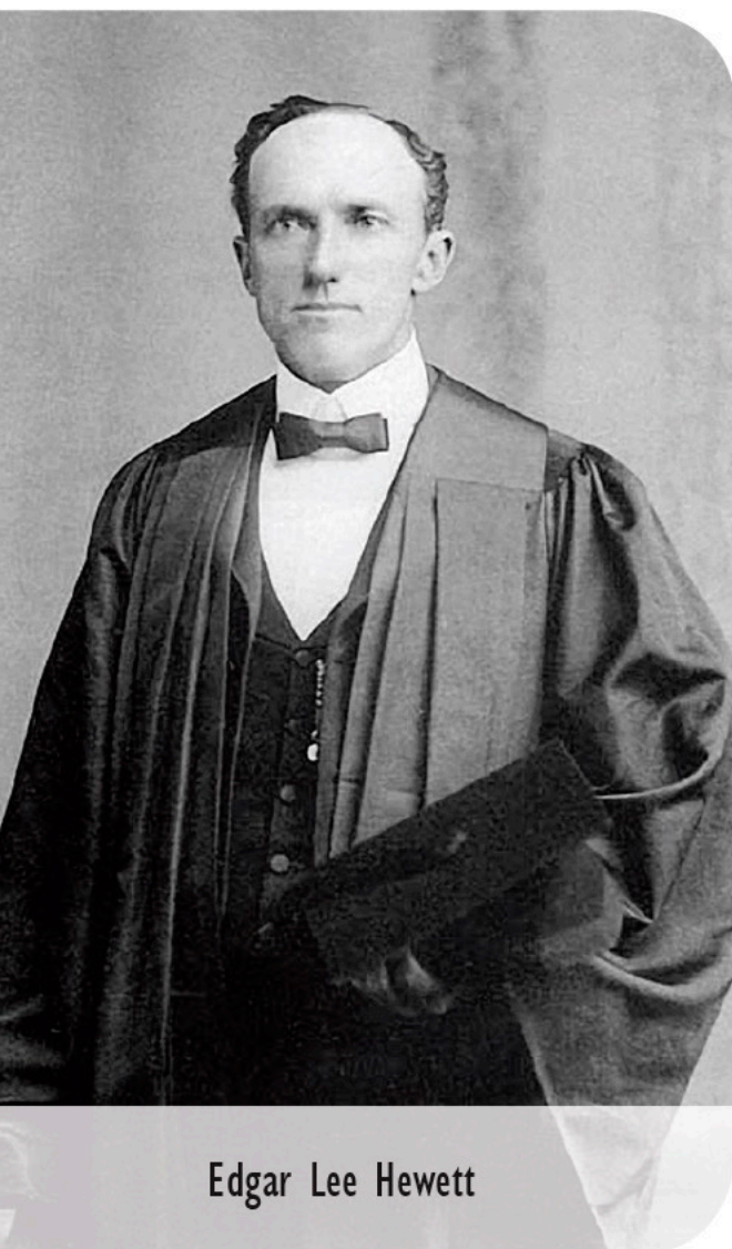
Edgar Lee Hewett